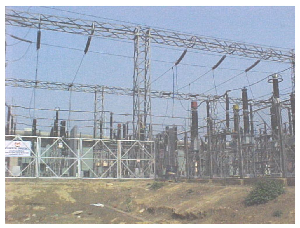
Typical High Voltage Receiving Sub-station

The 132 or 66kV cables will be laid through public pathways from Torent AEC Sub-stations to RSSs of Metro Authority. Each RSS shall be provided with 2nos. (one as standby) 132 or 66/25kV, 30 MVA single phase traction transformers for feeding to traction loads, being the standard design. This arrangement would also ensure that the system caters to additional power supply requirements in case of likely extensions of the corridors at either end. Sabarmati RSS can also be used for feeding 25kV traction supply to the proposed Regional Railway System.