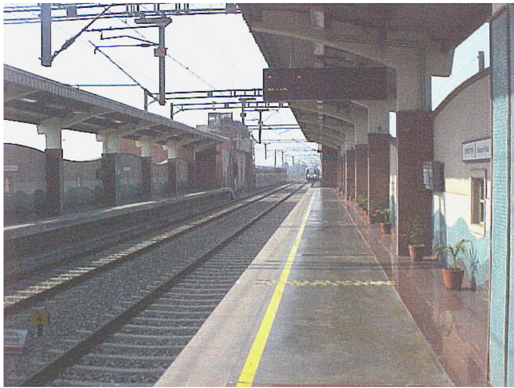
Typical 25kV AC Catenary Arrangement

25kV ac traction has the economical advantages of minimal number of traction sub-stations and potential to carry large traffic (60,000-90,000 PHPDT). The system requires catenary masts on surface/elevated section, thereby affecting aesthetics and skyline of the city. Suitable measures are required for mitigation of electro-magnetic interference (EMI) caused by single-phase 25kV ac traction currents. EMI mitigation measures are simple and well known compared to dc stray current corrosion protection.